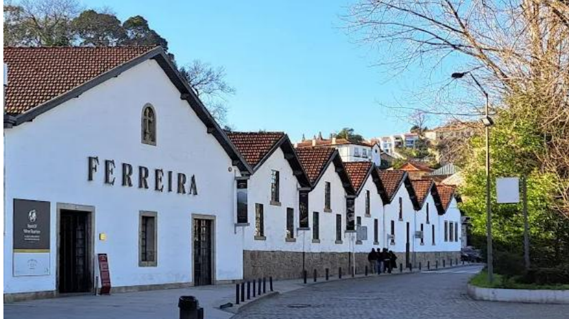
Caves Ferreira, Vila Nova de Gaia

Group 2.2 – 16h30m (up to 30 participants)