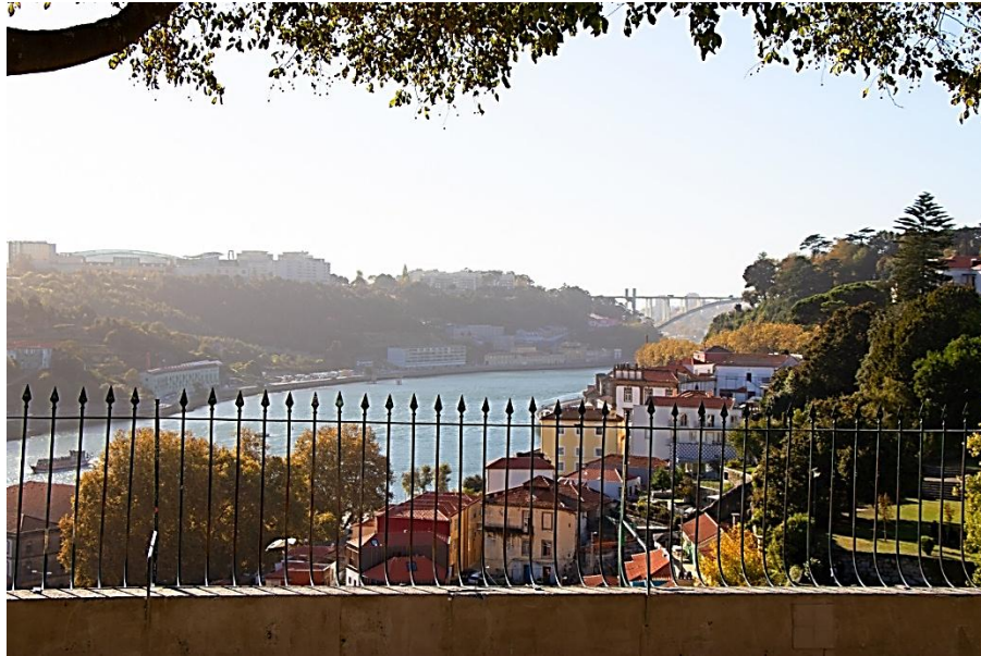
Panoramic view of Porto obtained from the Virtudes Viewpoint