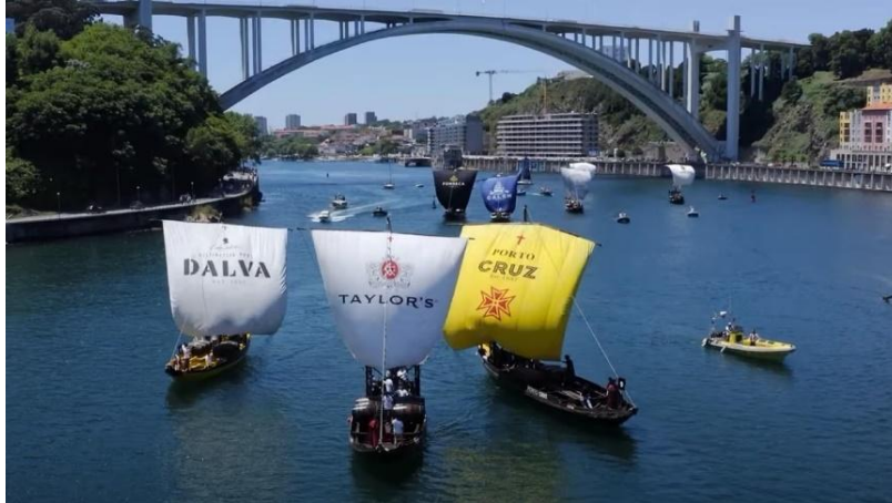
Rabelo Boat Regatta, 2025

Accessible view on both banks of the Douro River, between Arrábida and D. Luís I Bridges